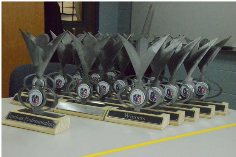
Photo series 1, Above: (From top to bottom) Student competitors and spectators gather during the practice rounds before the FIRST Robotics FTC Block Party competition; Students from Paragon and East Jackson Middle School compete head-to-head during a competition round; FTC Awards waiting to be handed out.