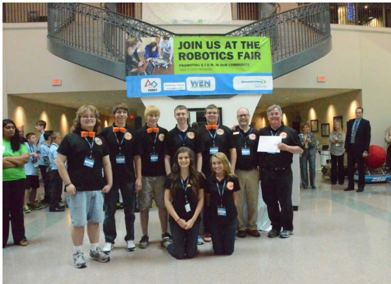
Photo series 2, Above: (from top to bottom) Two middle school students from Western middle school demonstrate their team robot's capabilities at the Consumers Energy Robotics Fair; Two students from the Jackson Area Career Center Jacktown Vectors demonstrating co-operation as they work on to support another team's robot; Jacktown Vectors stop for a group shot at the Consumer's Energy Robotics Fair.